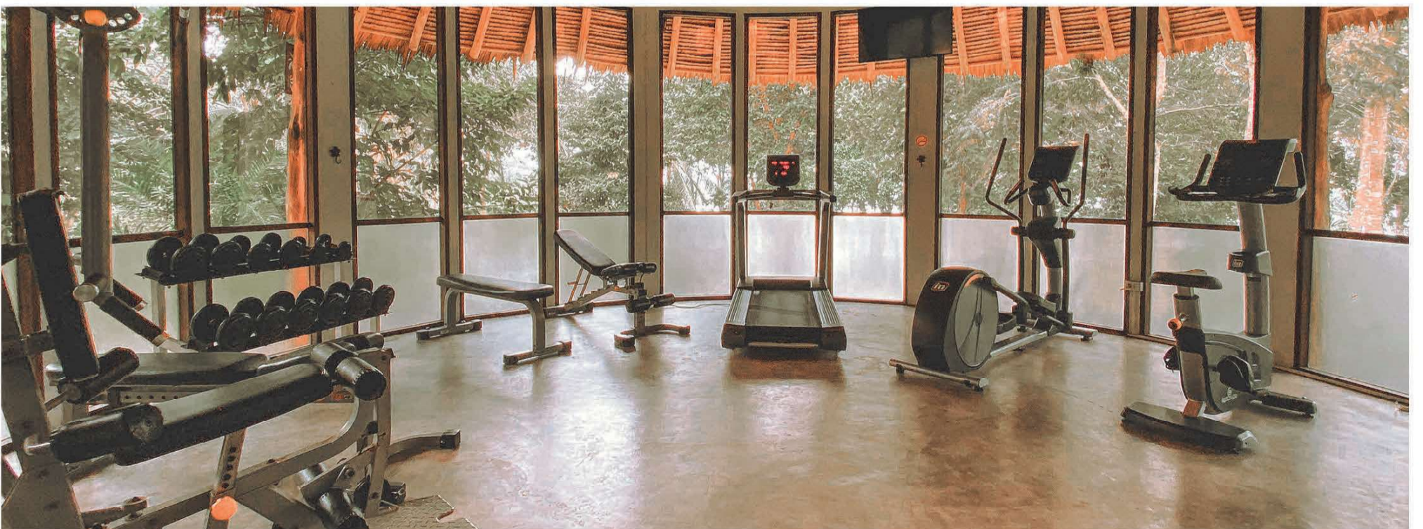
Fitness room (07:00 - 20:00) Feature weight training equipment free of charge.