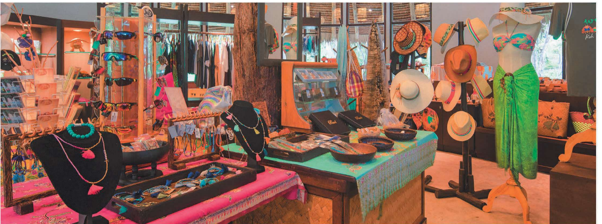
Chaba Gallery (09:00 - 21:00) Offers variety of products from snacks, drinks, souvenirs and handcrafted products.