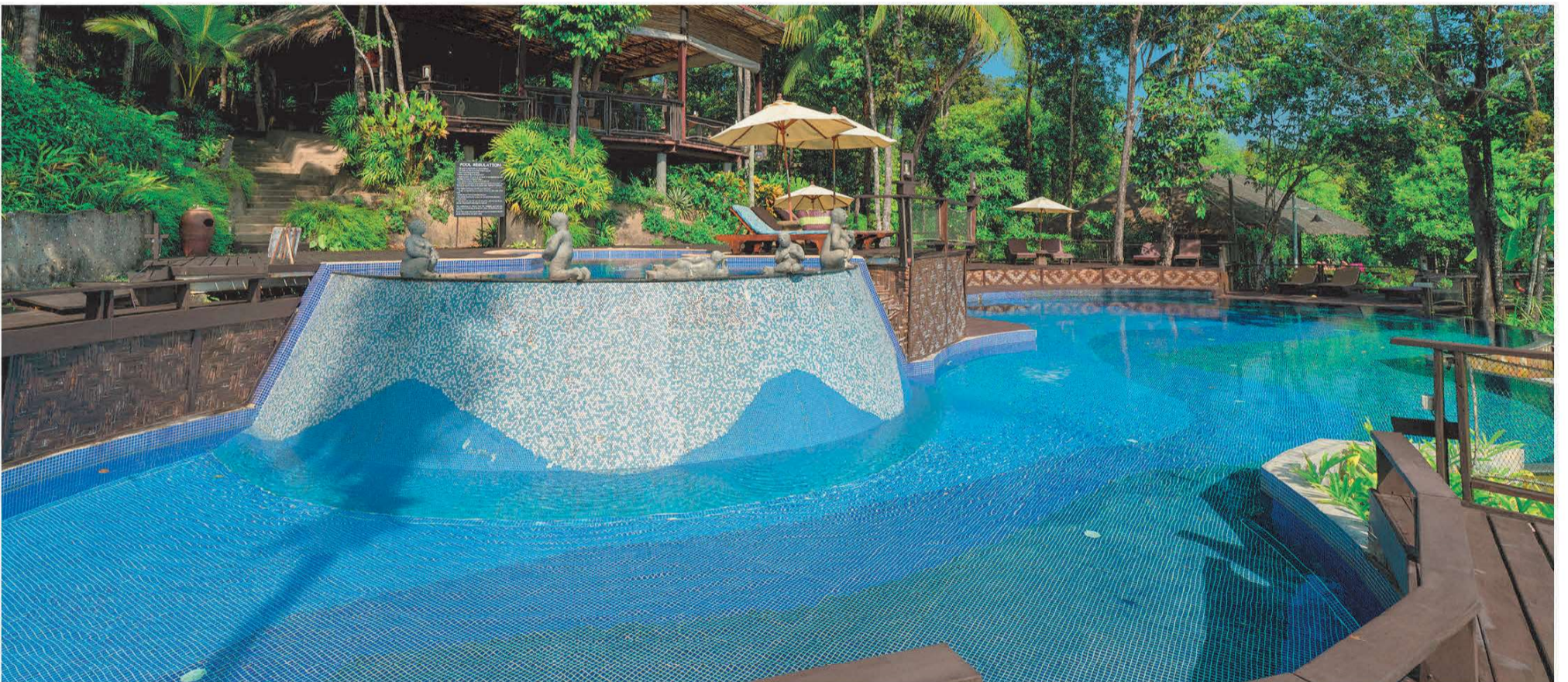
Jakkrajan Pool 400 sq.m. (08:00 - 18:00) - Infinity sea front pool with Jacuzzi overlooking the rice field. The pool is situated among Seaview Villa and Beachfront Villa which guests who stay in these villas can enjoy the privacy and overlooking at the rice field and the sea front.