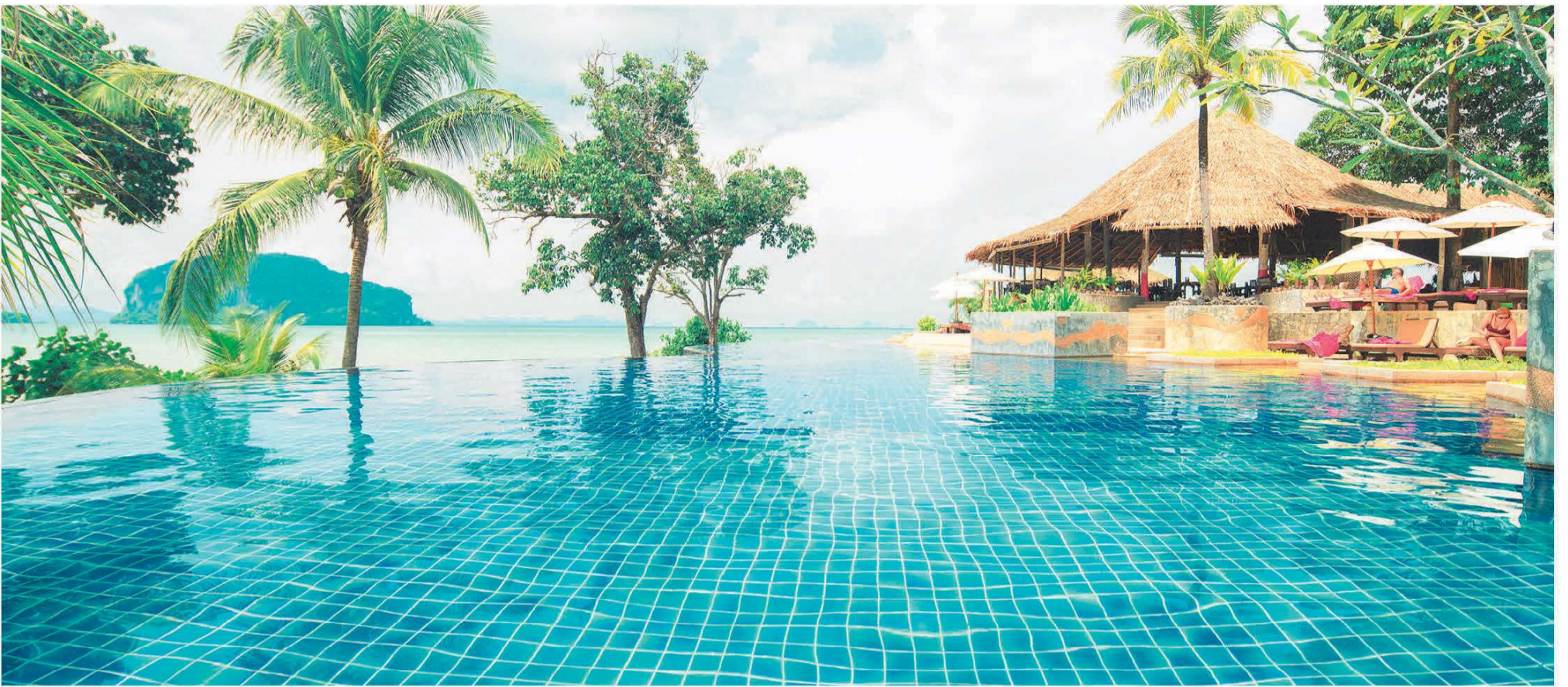
Main Pool 700 sq.m. (08:00 - 18:00) - Infinity edge pool with kid pool and Jacuzzi overlooking the view of Phangnga Bay archipelago.