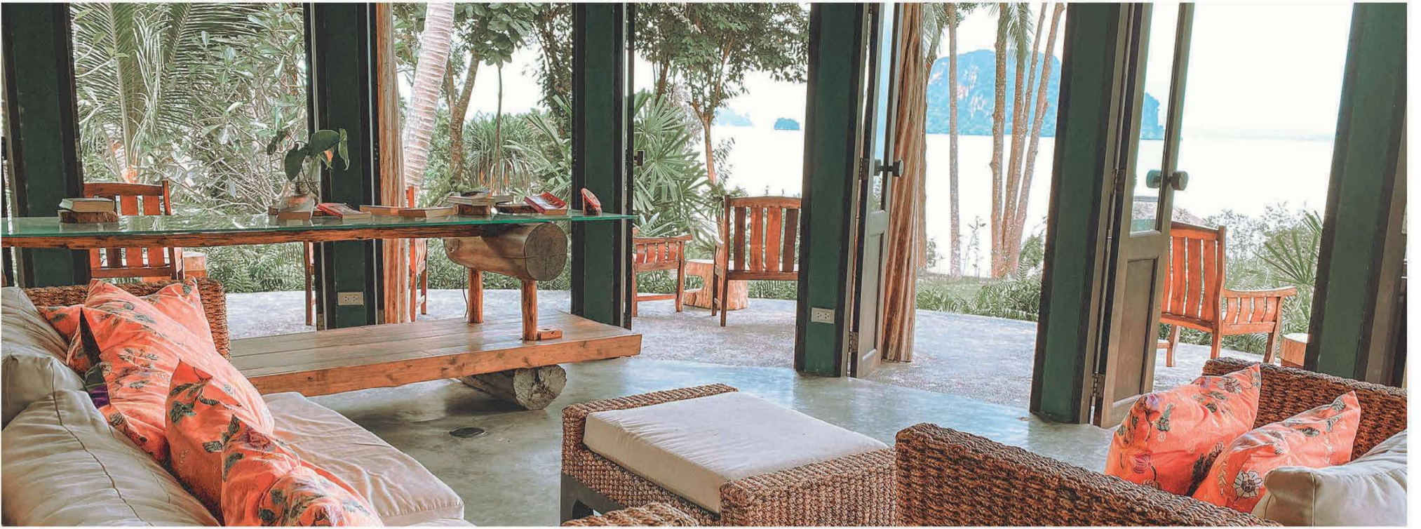
Dahra Library (06:00 - 23:00) Reading room with selection of reading materials with internet access.